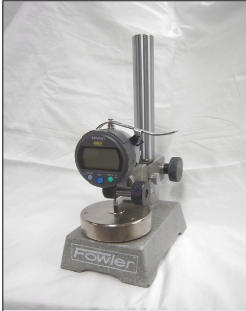
Model 543 Battery-Powered Digital Indicator & Stand. Shown with Lift Lever and Parallelism-Adjustable Anvil Option

Add Oakland's optional Parallelism-adjustable Anvil for optimum accuracy and performance from your micrometer system (shown)